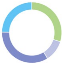
Asset country split

● core bond ● southern euro ● Other ● northern euro